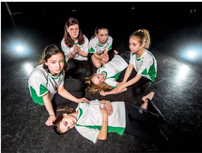
Poltair School's Performing Arts showcase February 2016