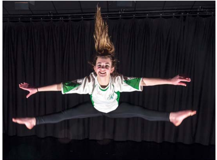
Poltair School's Performing Arts showcase February 2016

Poltairs' talented Performers were involved in the schools Performing Arts Showcase 'We Will Remember Them' last Thursday evening. The performance was a thought provoking collaboration of music and dance, involving students from all year groups and guest dancers from 4FS Dance Company. Choreography and musical scores were inspired by 9/11, the recent Paris Attacks, Tsunami and Female Empowerment, and fused together to create an emotionally charged evening of music and dance.