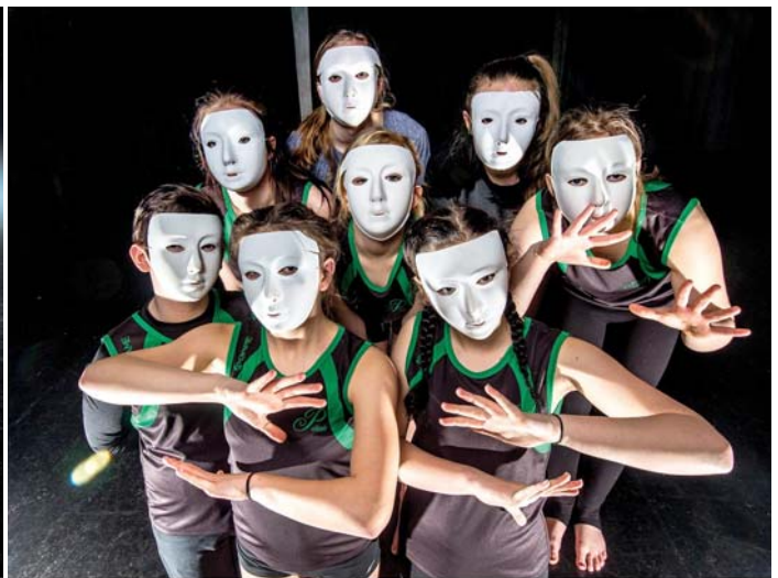
Poltair School's Performing Arts showcase February 2016

Well done to everyone that performed, and a huge thank you to everyone that helped.